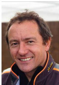
Russell Crowe Driver