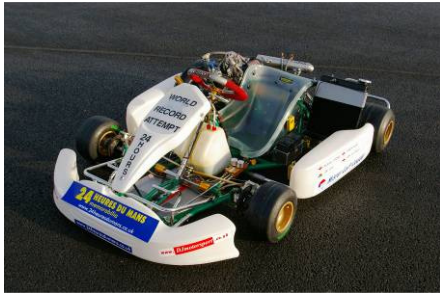
The World Record Kart

21:30 - Simon makes an unscheduled stop with a very sick sounding Honda. This time it is a piston failure and the barrel is beyond repair. At this rate they will run out of engines before the record is broken. The last engine is bolted on. It has the barrel from engine one with a new piston that was run in the day before. Only the mechanics seem certain of the origin of the parts that are currently spinning at 11000 rpm out on the circuit. They watch the kart depart and then set about building another working engine from what is left of the failed ones.